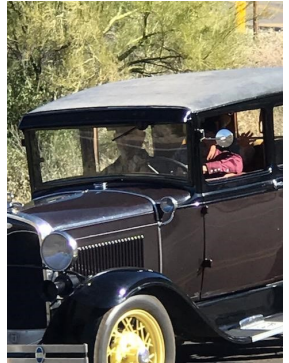
Little did he know but this young man lost

omething on his way to the parks Welcome Center, his spare tire. Fortunately the pick-up following him saw it roll down a wash and was able to retrieved it for him.